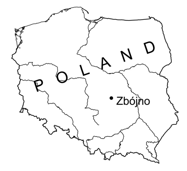
Fig. 1. Location of the Zbójno site in Poland.