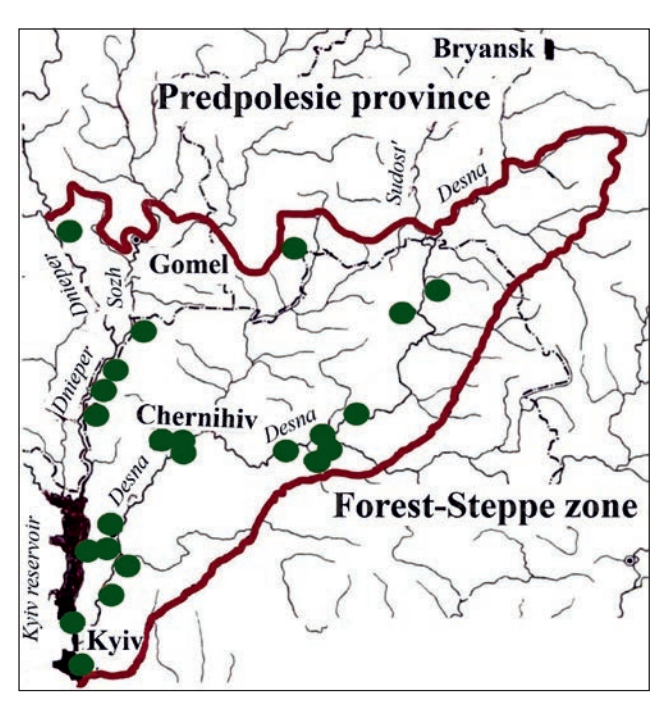
Fig. 3. Schematic map of the Salvinia natans range in eastern Polesye.

There are no threats to the spread of this relic species on the territory of eastern Polesye. None of its known localities disappeared during the last century. In some localities